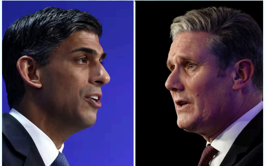
General Election 2024